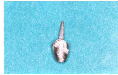
Fig. 2. CRD made from Co-Cr