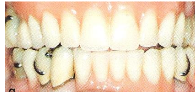
Fig. 12. Final appearance of prosthesis