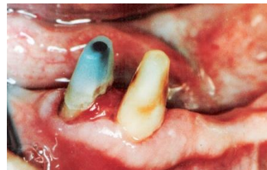
Fig. 11. 44 Abutment restoration with composite