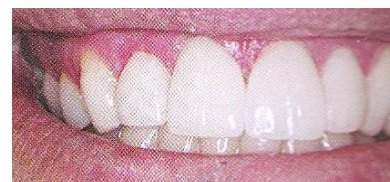
Fig 5. Final appearance of prosthesis