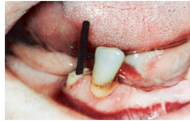
Fig. 10. 44 with carbon-fiber CRD.