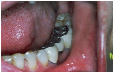
Fig. 9. Final appearance of prosthesis