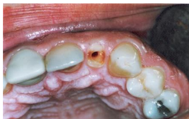
Fig. 1. 22 Preparation for cast CRD

The coronal abutment was prepared according to classic rules, softened dentin was excised, the radicular slot prepared with Peeso milling cutters and a cervical slot with an anti-rotational role. The CRD was cast after a mockup of self-polymerizable acrylate (Duracryl, Spofa) (fig. 2). The device was sandblasted. Cementing was done with zinc phosphate cement (Hardvard). The final fixed prosthesis was made from a Cr-Co alloy, coated with composite diacrylic resin (fig. 3).