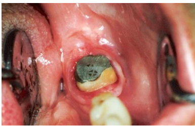
Fig. 8. 37 after abutment restoration with silver amalgam.