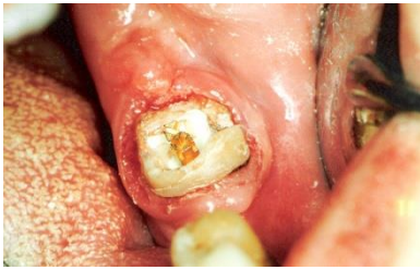
Fig. 7. 37 after endodontic treatment and application of a prefabricated metallic Dentatus CRD.