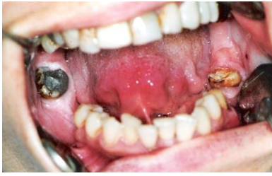
Fig.6. 47 and 37 with massive coronal destructions